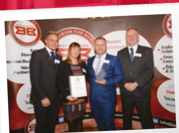
Plymouth - Best Overall Scheme