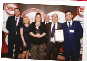
Bolton - Best New Scheme