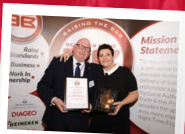
Sheffield - Most Innovative Scheme